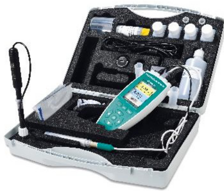
Figure 1. Transport case including all accessories and a 914 pH/DO/Conductometer equipped with an O 2 -Lumitrode and conductivity sensor for the determination of dissolved oxygen in a freshwater stream.

The sensors are both directly inserted into the surface water at the point of interest, to a depth of at least 3.5 cm.