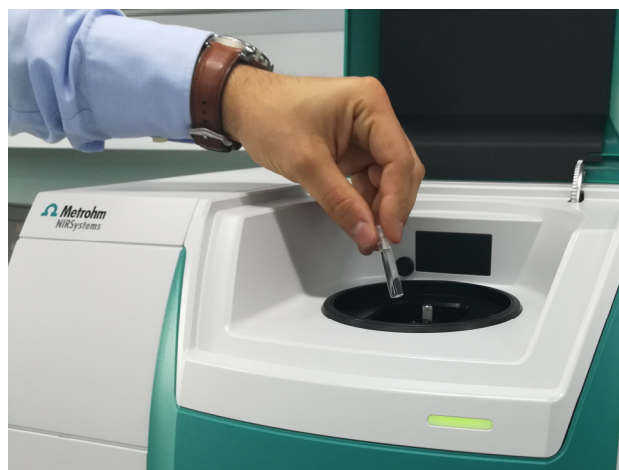
Figure 1. DS2500 Liquid Analyzer and a sample filled in a disposable vial.